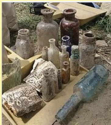
Bottles excavated at the site of the apothecary in June 2016.