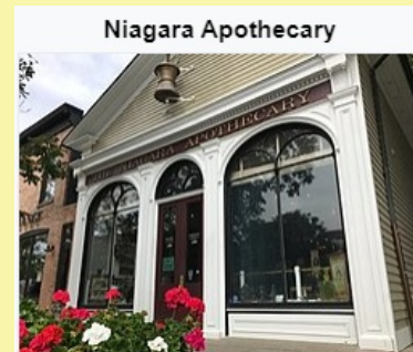
The Niagara Apothecary which today stands as a museum.