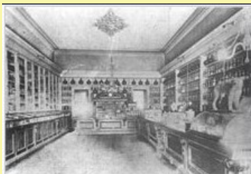
The interior of the Randall's Drug Store sometime between 1900-1910.

In 1969, the Ontario Heritage Foundation purchased the Apothecary and undertook the preservation of the property. The property was re-opened as a typical "Confederation-era" apothecary and receives approximately 100,000 visitors annually.