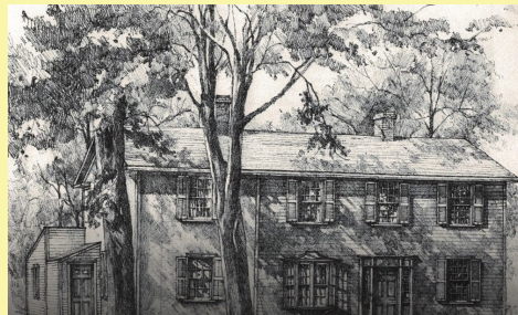
244 King Street Niagara-on-the-Lake