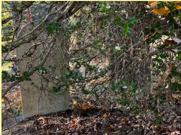
The Coleman and Donnalley markers before restoration

The Cemetery Board commenced a five year restoration project in 2021. The results are astonishing. Take a walk in our cemetery and see the results for yourself!