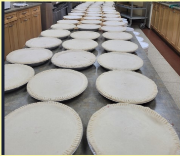
Cherry pies ready to be baked!