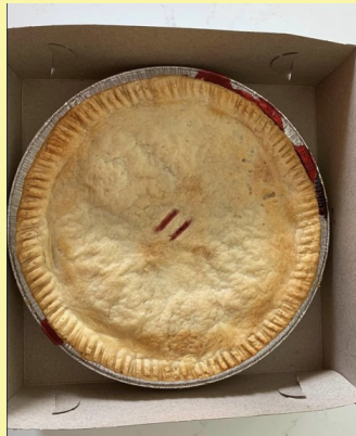
Cherry pie fresh out of the oven!