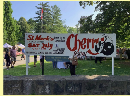
It was a fantastic day at St. Mark's.