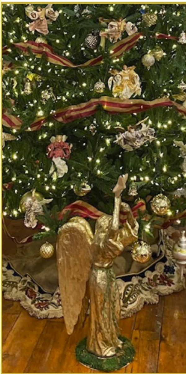
St.Mark's 2024 Christmas Tree

St. Mark's 2024 Christmas tree is adorned with a special collection of Neapolitan-inspired angels.