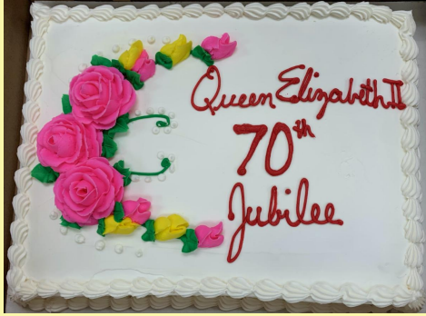
Delicious Jubilee Cake enjoyed by all on the church lawn following the 10:30 am service last Sunday.